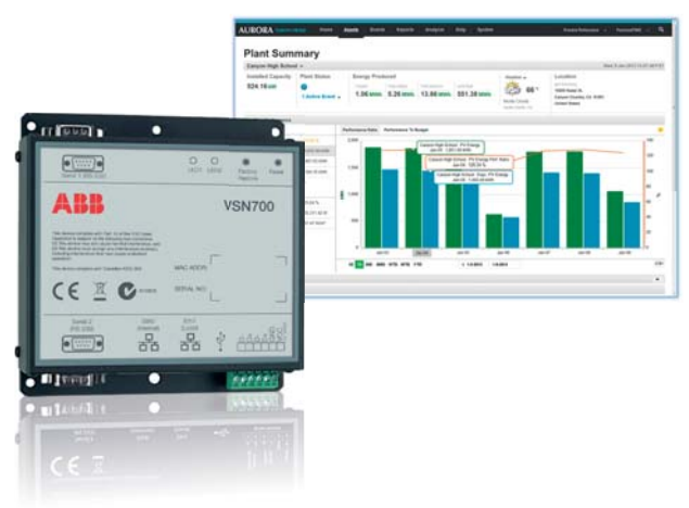
Aurora logger and web user interface

© Copyright 2014 ABB. All rights reserved. Specifications subject to change without notice.