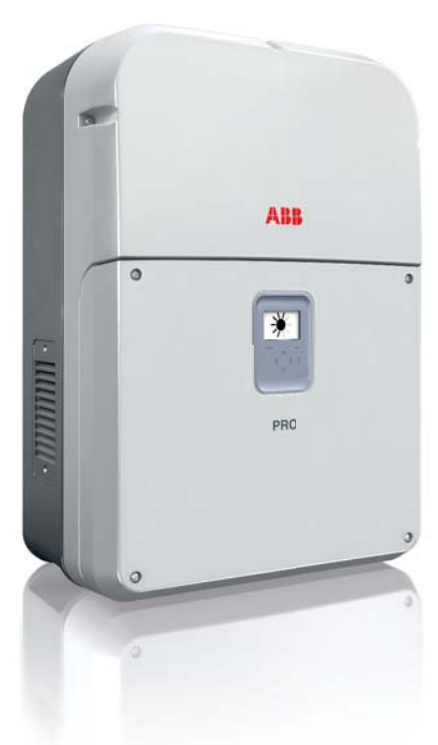
ABB string inverters cost-efficiently convert the direct current (DC) generated by solar modules into high quality three-phase alternating current (AC) that can be fed into the power distribution network (ie grid). Designed to meet the needs of the entire supply chain – from system integrators and installers to end users – these transformerless, three-phase inverters are designed for decentralized photovoltaic (PV) systems installed in commercial and industrial systems up to megawatt (MW) sizes.